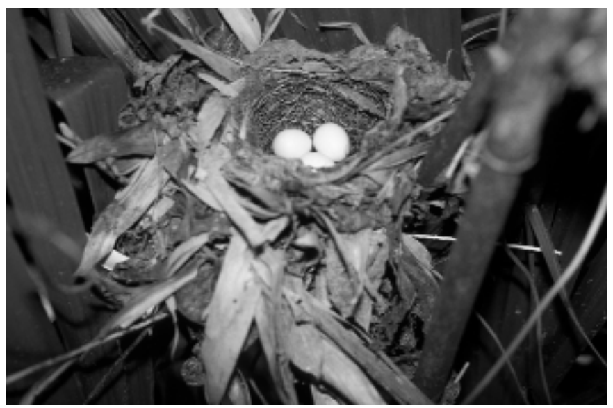
FIGURE 2. Swainson's Warbler nest in cane thicket in Mobile-Tensaw Delta, Baldwin Co., Alabama.