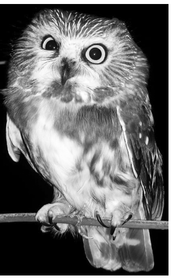
Northern Saw-whet Owl, 21 November 2007, Walls of Jericho.