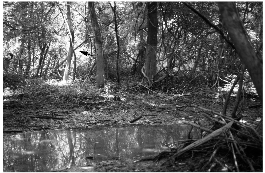
FIGURE 1. Swainson's Warbler nesting habitat in Mobile-Tensaw Delta, Baldwin Co., Alabama. Nest located in cane thicket (arrow). Photograph by B. Summerour on 13 May 2001.

During the 2004 season, few birds were heard singing in the study area and only one nest was found. The loss of cane from the previous season of prolonged flooding was no doubt a contributing factor in the decline of Swainson's Warblers in the area.