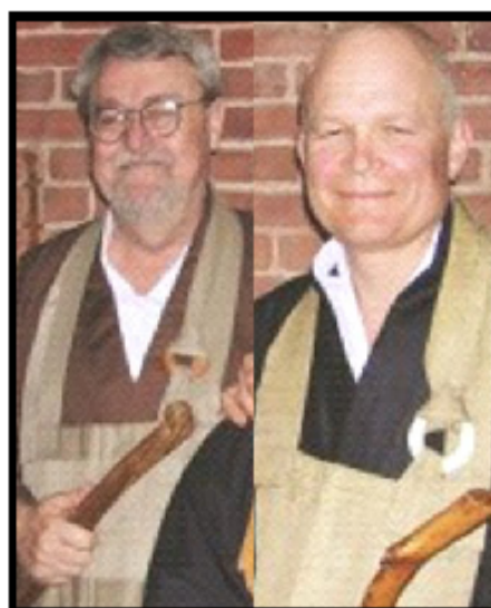
Group and private meditation, workshops, worship, small group conversations, and free time make for a rich weekend of practice.