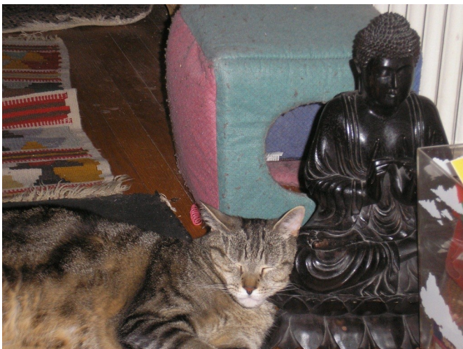
Myles, the Editor’s cat: Buddhān saraṇaṃ gacchāmi