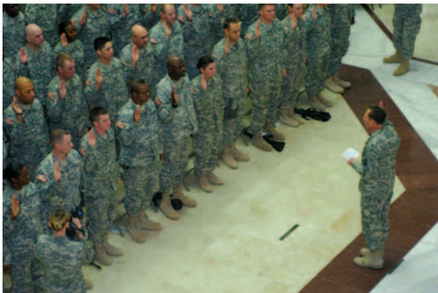
General David H. Petraeus, commanding general of Multi-National Force–Iraq, gives the oath of enlistment to Reserve soldiers at Camp Victory, Iraq, January 2008.

There were also important innovations in joint force operations in Iraq during the year. Until 2007, improvised explosive devices—small roadside bombs made from easily available materials—had been a leading cause of coalition casualties. Multi-National Corps–Iraq, working with experts from the Defense Department’s Joint Improvised Explosive Device Defeat Organization, responded by creating dedicated cells to share intelligence and train forces in the latest countering techniques. As a result, coalition forces reduced the number of attacks from about one hundred ten in September 2007 to about twenty-six incidents a year later. In addition, small interservice and interagency teams, working with Special Operations Forces, collaborated to share intelligence and sophisticated technology to successfully kill or capture key extremist leaders and destabilize their organizations.