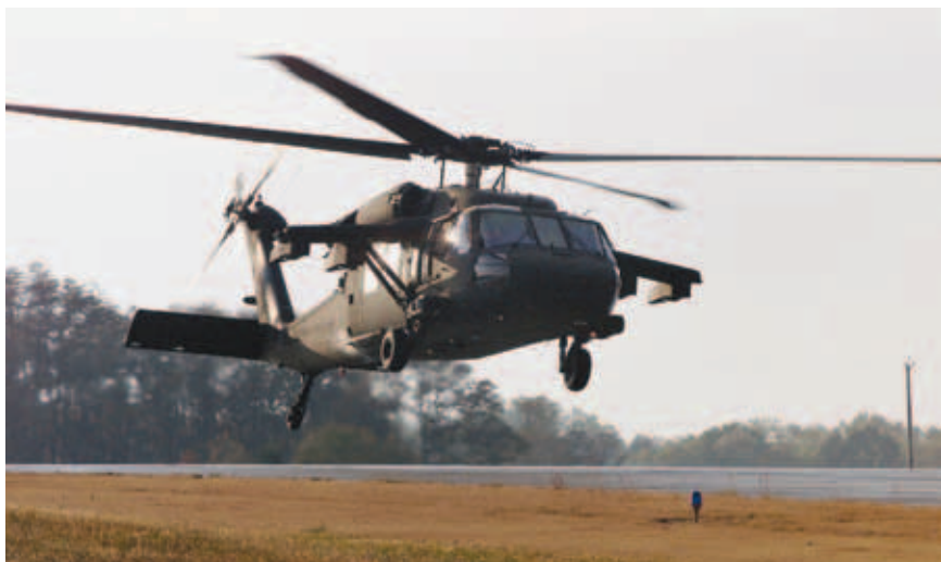
The Army's latest version of the Black Hawk helicopter, the UH-60M

The military began making extensive use of concrete barriers, checkpoints, curfews, and biometric technologies for identification, including fingerprinting and retinal scans to divide fractious areas within the country and to track individuals. In addition, whereas the coalition had consolidated its forces in large forward operating bases outside of population centers to ensure their protection up through 2006, beginning in 2007 it began moving to smaller outposts within local communities to maintain closer contact with the populace and work more closely with their Iraqi partners. As of January 2008, for example, Multi-National Division–Center had established fifty-three such bases in their restive area south of Baghdad.