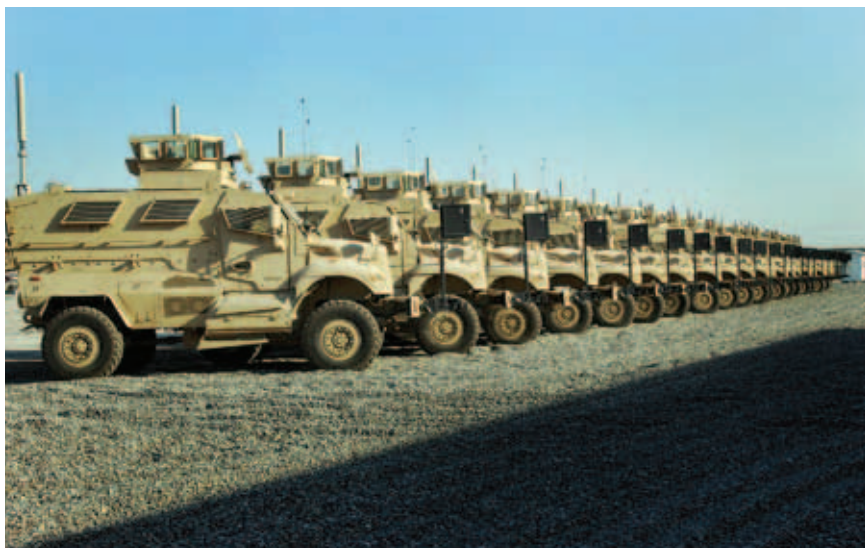
The first MRAPs arrive at Camp Liberty, Iraq, in November 2008.

In FY 2008, FCS remained the Army's biggest RDA program, involving more than 550 contractors and subcontractors in 41 states and 220 congressional districts, but it still experienced a number of contractions. In April 2008, the Army revised its total cost down by 1.6 percent. In June, it restructured the program again. Whereas the service originally had intended to begin fielding full systems in FY 2014, principally to heavy brigades, it refocused on developing "spin out one" technologies that it would field to ten infantry brigade combat teams scheduled to deploy to Iraq and Afghanistan between 2011 and 2013. The program, however, did achieve a number of milestones during the fiscal year. By August, the Army Test and Evaluation Command and TRADOC began preliminary tests of the equipment for the infantry brigades. In September, the FCS successfully fired the first artillery projectile from the Manned Ground Vehicle, Non-Line-of-Sight Cannon prototype. As FY 2008 drew to a close, the Army was considering a plan to accelerate the fielding of prototypes by transferring more than $2 billion from funds used to maintain its older systems, most notably the M1 Abrams tank, Bradley fighting vehicle, and Stryker vehicle, to the FCS, but even as these changes were under discussion, Congress was debating additional cuts to the program and increasing its oversight.