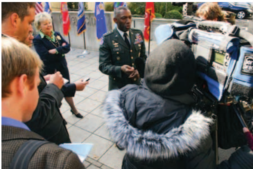
General Ward meets with journalists following a 17 October 2008 ceremony marking the establishment of U.S. Africa Command.

In creating AFRICOM, the U.S. government hoped to improve military coordination in the region. It also wanted to relieve EUCOM and Central Command (CENTCOM), which had been shouldering most of the U.S. civil and military operations on the continent, while struggling to balance their significant duties in the wars in Iraq and Afghanistan. The new command was expected to devote significant resources to non-military activities, such as stability operations and training partnerships with local forces. Many of these activities had been overseen by EUCOM and CENTCOM before FY 2008 but were being reassigned to AFRICOM during the year.