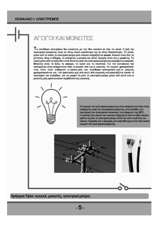
Figure 4: A textbook page of the AR book.