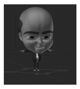
Figure 3: The virtual guide.

Onboarding is the act of bringing a novice into your system. [15] [16] A virtual guide teaches new users how to interact with each virtual lab and continues to support them either by giving them instructions or by posing challenges for them to solve. The challenges set by the virtual guide are of increasing difficulty and guide the user in discovering the potential uses of each lab. These challenges give students goals and the feeling like they're working towards something. As rewards for these challenges the gamified application includes a point system, proficiency levels and achievement badges that help the users track their progress, motivate them and reward their effort. Additionally a "Free mode" allows users to freely experiment with each virtual lab and earn extra badges exclusive to this mode. These badges were implemented in order to reward players that are willing to step outside the constraints of the structured