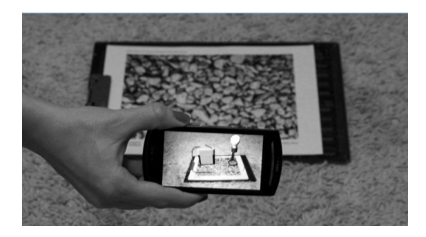
Figure 6: Early Implementation of a virtual lab.

ment. The design and rendering of the 3D models required for the project is done using the Blender 3D computer graphics software [4]. The models created in Blender are exported to the Unity 3D game engine [5] where the interactive game environment is created and the gamification elements are implemented. Finally the Vuforia plugin for Unity 3D is used to add the AR features.