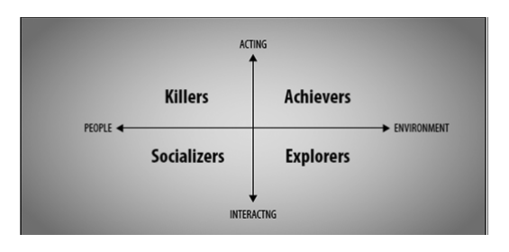
Figure 2: Player types.

facet of the game and discover all of the game's secrets. -Socializers: Players view the game and its objective as a catalyst for social interactions.