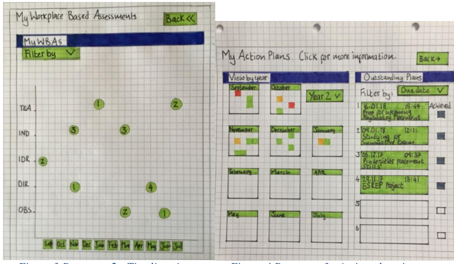
Figure 3 Prototype 2 - Timeline view Figure 4 Prototype 3 - Action plan view

Phase 2 : Based on an initial analysis of the transcripts and on the reports from the researchers involved in the co-design workshops, it was clear that Prototype 1 was perceived by both students and tutors to have the greatest potential to support students' reflection and action on their WBA feedback. It was considered to be easily understood and to provide a clear view that allowed students to compare their current progress against expectations and drill-down to see the feedback. Students reported that they would use it to plan their activities on placements.