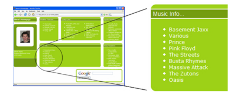
Fig. 1. Personalised Web Page Built by the Context-Informed CBR System

The development of Ticketyboo came from a visualisation project where we sought to display personalised homepages for users about which there was an abundance of context data. In UCD we have a number of sensors for all kinds of context data, including location-awareness, news-feeds, weather, music preferences, calendar information and TV information. The personalised context homepage may be customised by users to display information that is interesting to them. Ticketyboo was the first recommender system to be integrated with this webpage; it consists of a frame in the webpage that links to ticket information for the music artists that a user is listening to. Figure 1 shows a screenshot of one of the author's homepage with the Ticketyboo frame magnified. Ticketyboo runs continuously in the background, examining music listening statistics and calendar information and uses these to recommend concert tickets based on the user's context, i.e. their music tastes and availability. By clicking on any of these artists, the user is sent to the relevant page on a real ticket website where they may purchase tickets for an upcoming concert by those artists. These tickets will only be offered to the user if they are at a convenient time for the user.