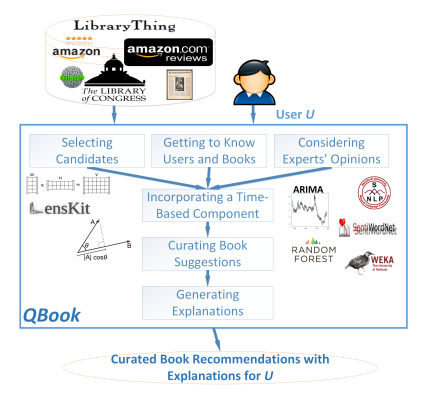
Figure 1: Overview of QBook