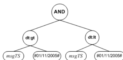
Fig. 9. The expression tree for the Example 4.

From this expression, we can create the expression tree as depicted in Fig. 9.