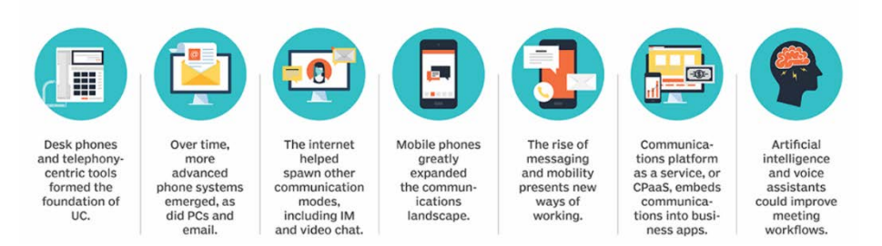
Fig. 1. Evolution of unified communications [3]

In the beginning, there were desk phones. Now, unified communications takes on many forms, including messaging, mobility and video conferencing. While various apps and endpoints are available, businesses need to ensure these tools are integrated with each other. Looking ahead, as unified communications continues to evolve, businesses need to be open to ongoing evolution.