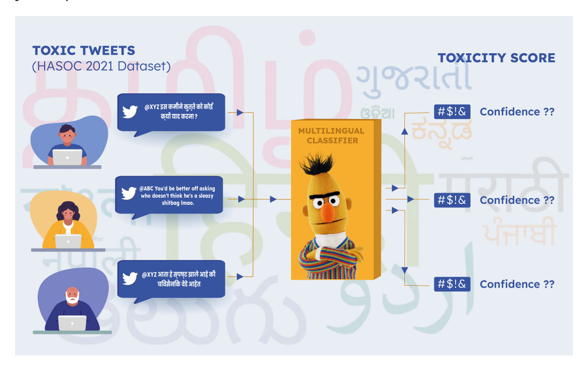
Figure 1: Overview of HASOC 2021 Problem Statement

develop monitoring systems that can identify hate speech amongst billions of text comments posted by users.