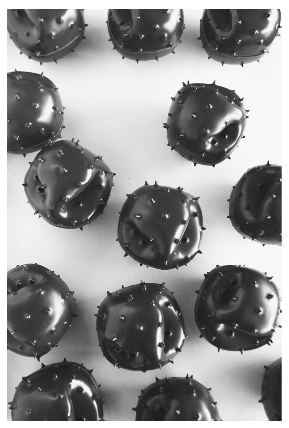
Dustboxes, a particulate-matter sensor for monitoring air quality developed by Citizen Sense.