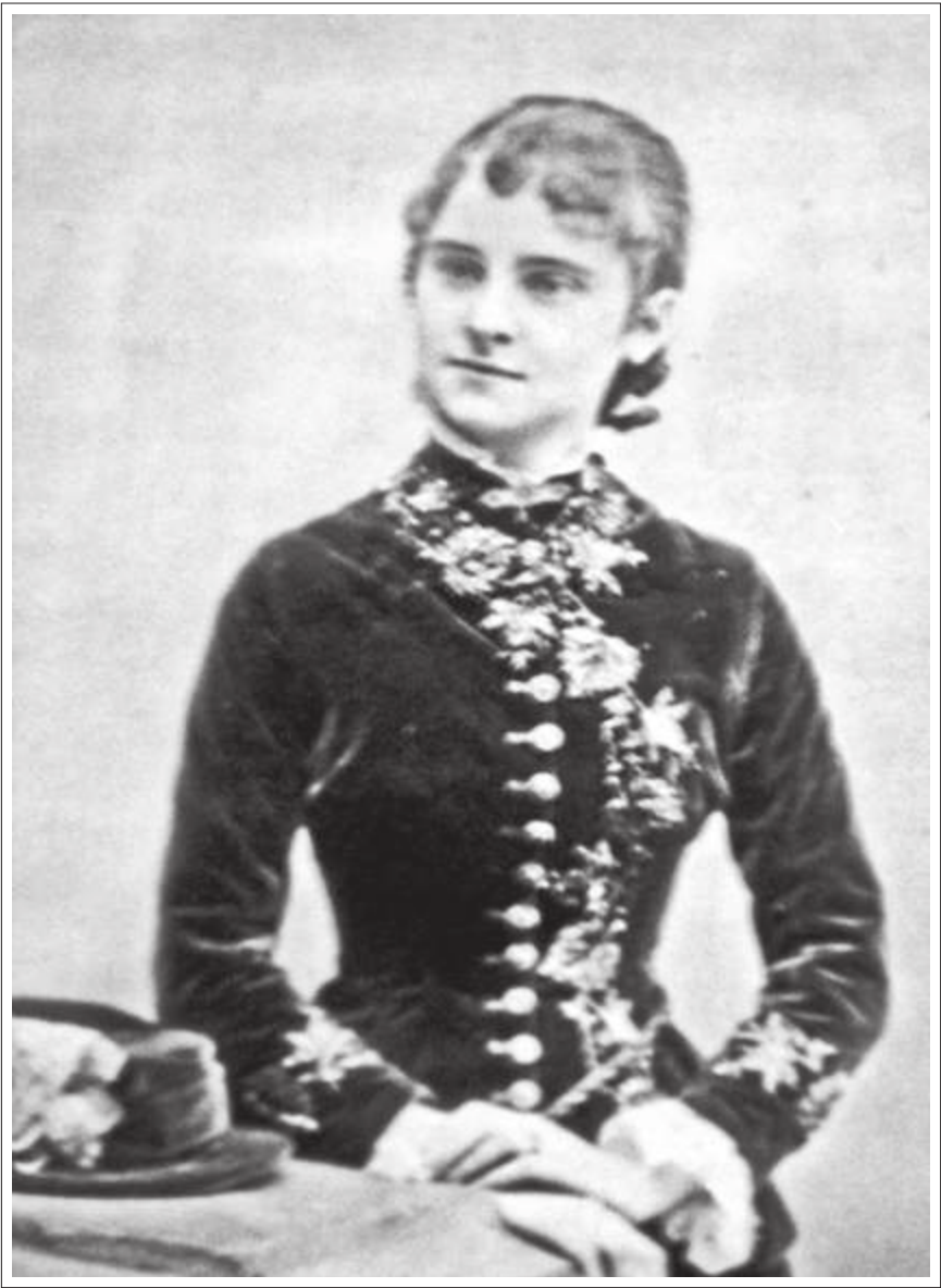
IDA OLMSTEAD COOK (1859–1942)