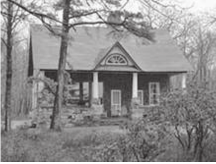
Cook's cottage built in 1901 at Blooming Grove Hunting and Fishing Club in Pike County, Pennsylvania, as it appeared in 2006.

In 1901 Cook leased a site and built a cottage on the south side of Lake Laura, one of seven lakes on the club's acreage. Cook's cottage is located near one other cottage but is otherwise far away from all the others. We can assume that he used it to truly get away. This Pennsylvania cottage was the first home Cook ever built for himself, and he used local labor and materials. 11 The style is typical of the era and the location: bluestone pediments and chimneys in a wood structure built with