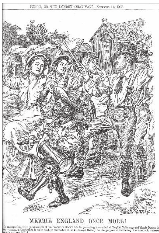
“Merrie England Once More,” Punch, November 1907, cover. Cartoon by Bernard Partridge.

teaching folk dance and developing his or her own reputation in the field. In May 1909, the two even sat on the same panel to adjudicate a children’s folk dance competition held in conjunction with the Shakespeare Festival at Stratford-on-Avon. But if Sharp remained polite in public, he bristled in private. He increasingly chose to distance himself from the Espérance girls’ performances and in a March 7, 1909, letter to Neal made the breach formal, chastising her for incorporating stories he had told her about folk singers into her programs. Not to put too fine a point on their difference and the import—moral, financial, institutional, and authorial—it carried for him, he concluded, “So that it comes to this: if you wish to pose as an expert and authority you must not ask me to support you.” 33