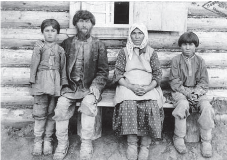
3.1: The only family in Kibiak-Kozi that did not apostatize. RGIA, f. 821, op. 4, d. 72, photograph no. 7. No date.

at the end of the eighteenth century, Krāshens of Elyshevo and Saltygan Kliuch left for the cities of Kazan and Chistopol', or Menzelinsk district. In the same area, villagers of Savrushii started tailoring later, in the 1840s, and, coincidentally, apostatized later under the influence of Elyshevite relatives, in 1879. In the volost' of Elyshevo, sixteen of twenty-one villages had seasonal laborers among their populations. In some villages, itinerant laborers comprised half the inhabitants. In general, the greater the proportion of itinerant tailors, the greater the Islamization of a given village. In Niki-forova, a village slightly touched by the apostasy movement in the 1860s and 1880s, the peasants enjoyed a higher yield, and because of the proximity of dense forests, involved themselves in woodwork. Unlike the villagers of Elyshevo volost' , only a very few left the village. Significantly, the peasants of Kibiak-Kozi volost' , with the largest number (1,122) of seasonal tailors in Laishevo district, proved to be more obstinate in their apostasy than their neighbors; unlike nearby Elyshevo village, Kibiak-Kozi refused to rescind its petition to be recognized as Muslim, even when the governor came with his troops in June 1866. The only family in Kibiak-Kozi who refused to apostatize well into the 1890s was headed by a miller who worked among Russians. 11