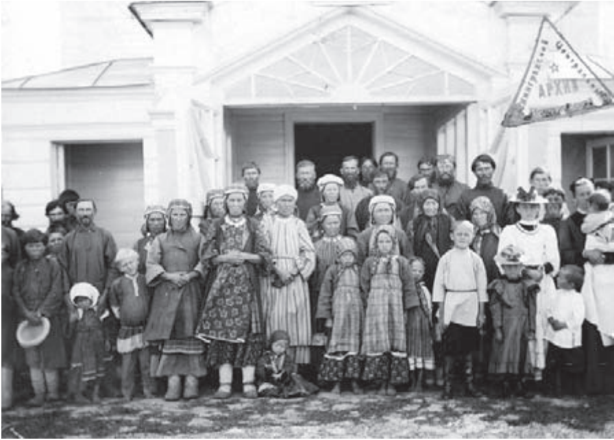
3.2: Krāshens standing in front of their church in Iantsovary, Laishevo District. RGIA, f. 821, op. 4, d. 72, photograph no. 2. No date.

Concerned by the increasing number of apostates in Apazovo, Kazan district, missionaries opened a carpentry-turnery school in 1907 to keep the boys from tailoring with their fathers. In the same spirit, the Brotherhood school of Staraiā Ikshurma started a cobbler workshop and the school of Subash (Gorokhovie Pole, Mamadysh district) opened a workshop manufacturing wheels and sleigh runners, but all in vain. 16