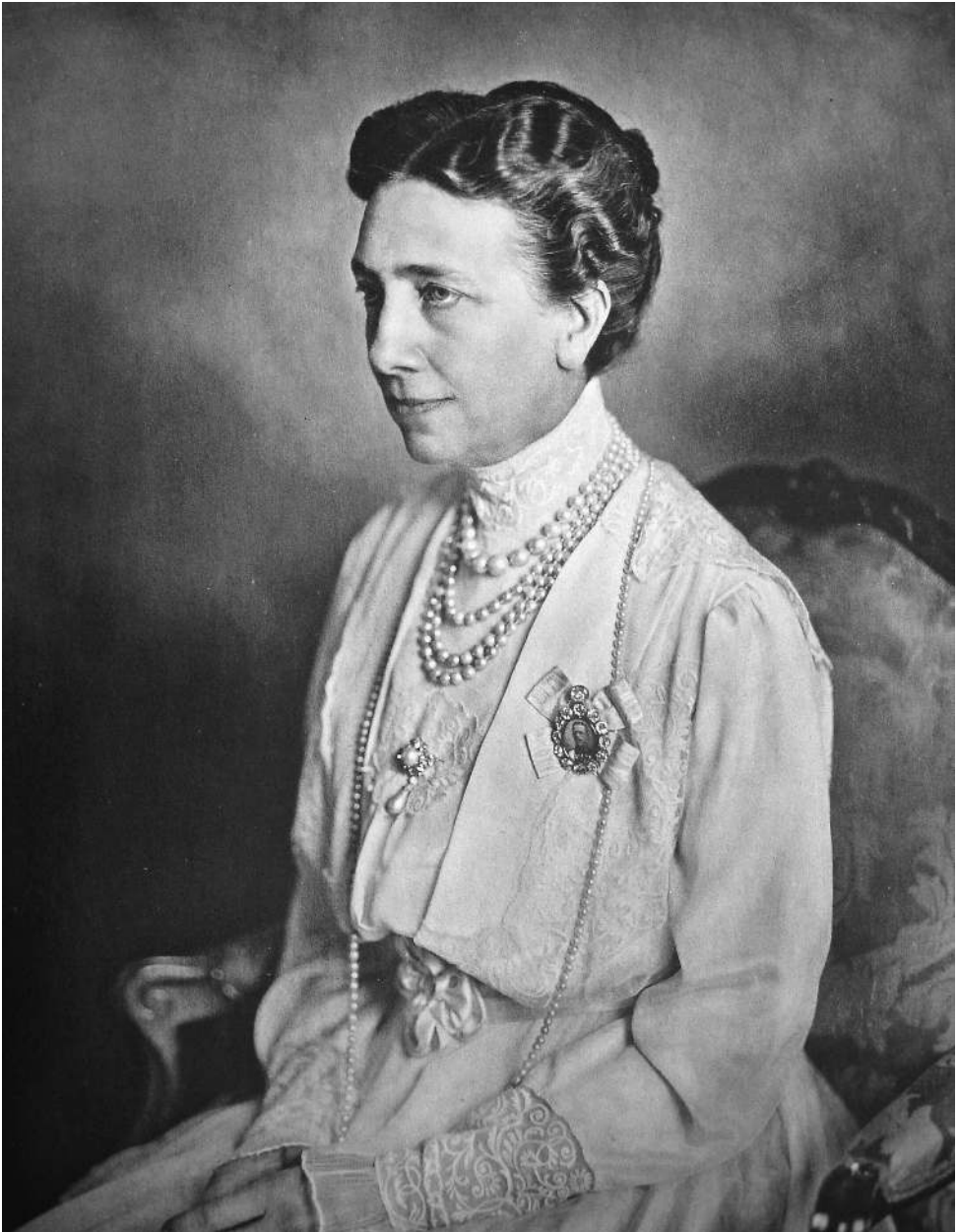
Queen Victoria of Sweden.