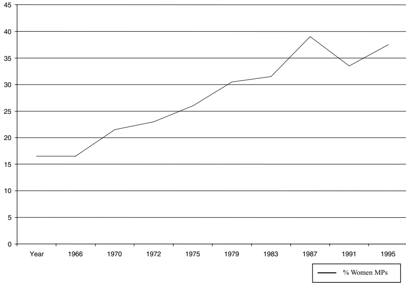
Figure 7.1 Finish Women in the Eduskunta, 1966–2003