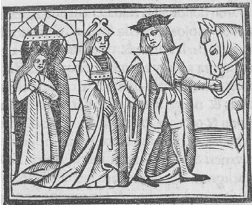
Figure 2 Woodcut accompanying the chapter with Amadís's erotic liaison with Oriana. Amadís leads Oriana by the hand while her maid looks on, modeling the affective response the scene should elicit from its readers. From the 1533 Venice edition published by Juan Antonio de Sabia.

In agreement with de Lauretis, I would argue that some chivalric representations of literate women do merely inscribe gender norms as they existed in early modern Iberia. Others, however, including the depictions of women treated in this book, also make potential contributions to new practices, if at times ambivalent ones. Characters like Oriana make small steps toward independence through literary gestures that real readers could potentially imitate. As such, chivalric women contrast with the women of the exemplary tradition, including Amazons, Biblical heroines, and saints, who are represented favorably but who exist in a context very different from that of their readers. As Pamela Benson points out, texts like Boccaccio's De Mulieribus Claris ( The Famous Women , 1374), Álvaro de Luna's Libro de las claras e virtuosas mugeres ( Book of Famous and Virtuous Women , 1446) and even Christine de Pizan's La cité des dames ( The City of Ladies , 1405) are paradoxical in their praise of women; they only offer examples that would be inconvenient or impossible for their female readership to